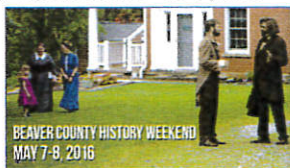
BEAVER COUNTY HISTORY WEEKEND MAY 7-8, 2016

This year's theme is Labor and Industry in Beaver County so the school will be highlighting the students' chores that would have been done on the farms both before and after school.